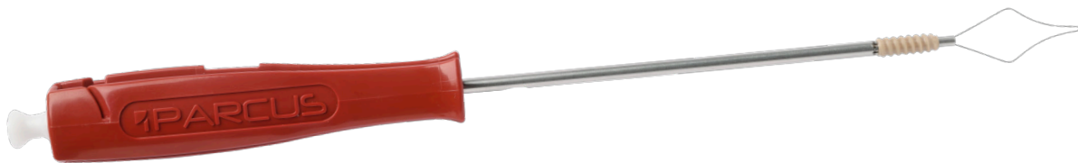
Twist Knotless DEX